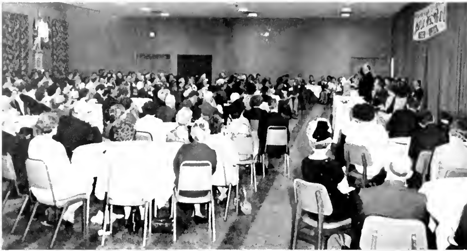
Part of the group at the banquet during the Alumni Homecoming at the Queen Elizabeth building.