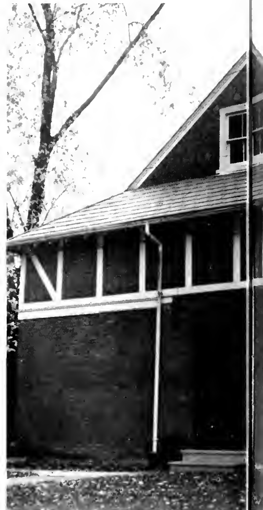
HARRIS MEMORIAL CONSERVATORY